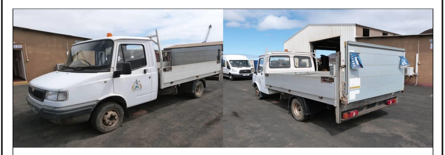
Lot 2 – LDV Tail Lift Single Cab 2.4L Diesel, 2005 Model In running order (recently fitted with new cylinder head and fuel injection pump) and complete with spares