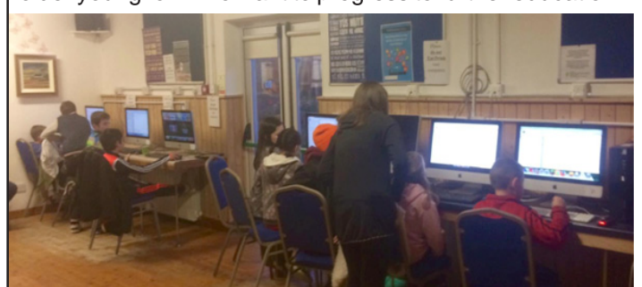
Arranmore's CoderDojo gives the kids a head start in life. Soon St Helena will be able to do the same when the fibreoptic cable lands here and ground stations are in operation.

Another bonus is participation in the global CoderDojo movement which started in Ireland but now includes 2,000 communities in 107 countries. CoderDojos are programming clubs for children where they learn computer programming and how to build apps. Arranmore's CoderDojo opened in 2012 and is one of the oldest in Ireland. The much improved internet connection has also boosted distance learning opportunities for older young folk who want to progress to further education.