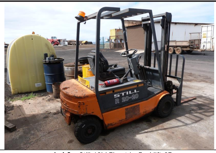
<u>Lot 3</u> – Still 48V Electric Forklift 2T 2005 Model Not in running order (require 48V battery system) but complete with spares

In addition, the Ascension Island Government invites tenders for Lot 4 as listed below.