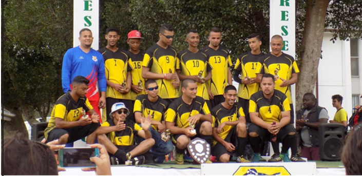
Bellboys Knock Out Cup Runner up