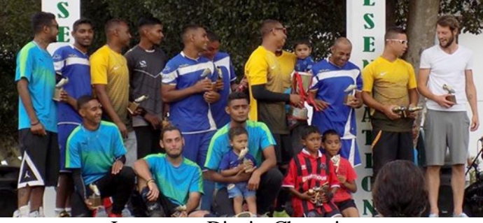
Jamestown District Champions