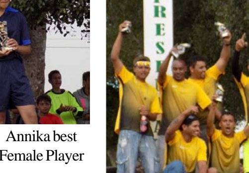
Rovers League Champions 2019