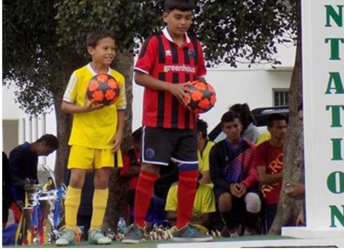
Aden & Blaze players of the match