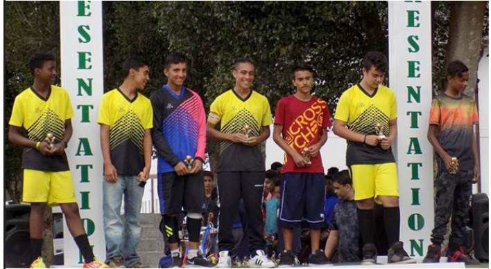
Galacticos Treble winners 2019