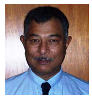
To The Electorate.

Frustrated and wanting a change, then in this up-coming byeelection make sure you put your X by my name.