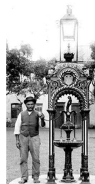
The original memorial fountain complete with canopy

** jobs worth - officials who uphold petty rules even at the expense of humanity or common sense