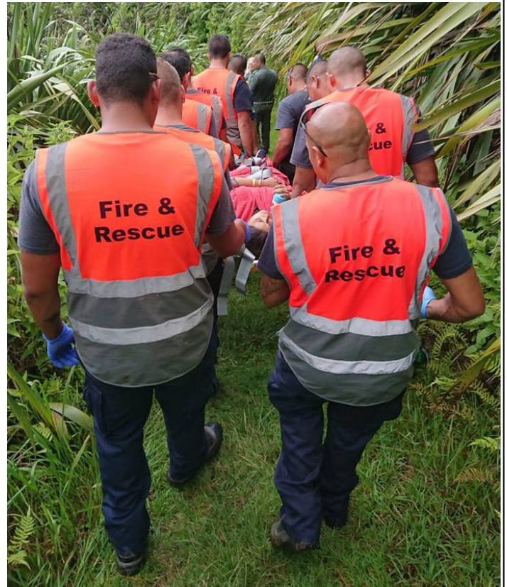
The Mountain Rescue Team