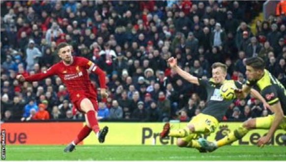
Liverpool Captain Jordan Henderson only weeks away from lifting that elusive Premier League Trophy

With 13 games to go Liverpool just needs 6 more wins to secure the Premier League title.