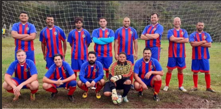
Local and English Football has Started

VOLUME XV ISSUE 28, 19 th JUNE 2020, PRICE £1