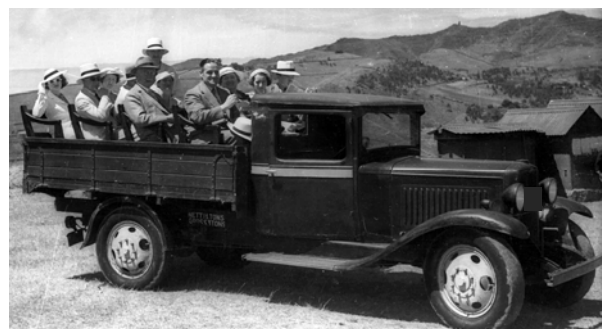
TOURING ST HELENA 1930/40's STYLE.....Who remembers the registration number of this vehicle back in the day?