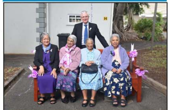
HE Governor and elderly members of the community