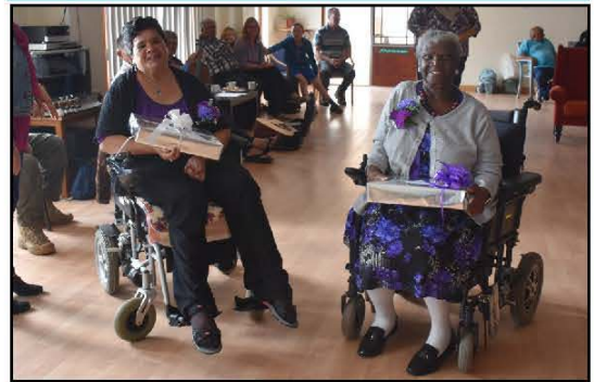
CCC residents receiving gifts from the United Nations