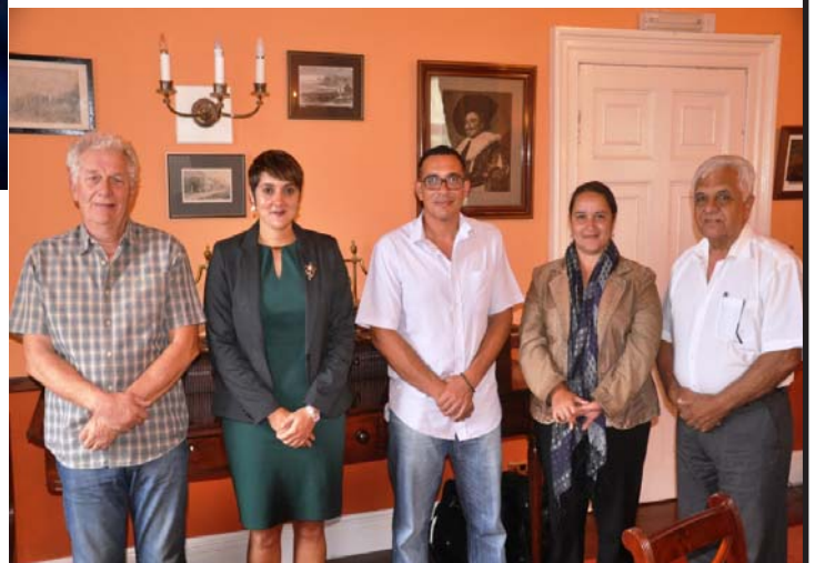
INDY PICTURE QUIZ.....Series 1 - Elast From The East Picture 21...