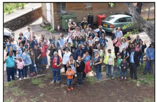
Participants at the Mule Yard

The Health Directorate also facilitated an information stall on diabetes in the Jamestown Market on Friday, 12 June, where members of the public were able to talk to the Diabetes Nurse about the risks, symptoms and management of diabetes. Anyone who would like to arrange an appointment with the Diabetes Nurse to discuss the management and support available on St Helena can call the Outpatients' Clinic on tel: 22321.