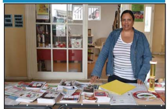
Diabetes Nurse at the Jamestown Market

#StHelena #WalkForDiabetes #DiabetesAwareness #AltogetherHealthier