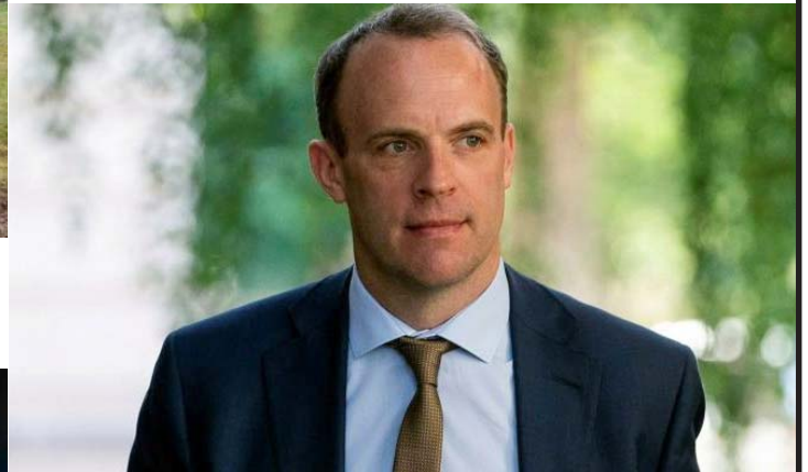
Governance Commission has Finished its Work – Almost