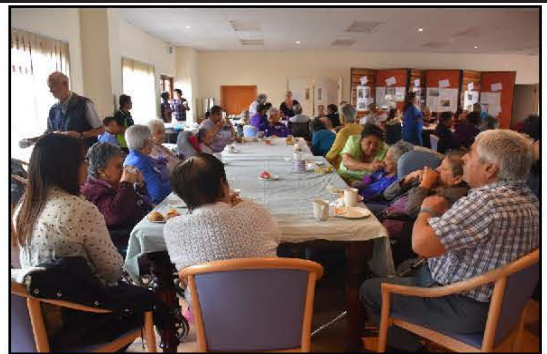
Residents and their family enjoying refreshments