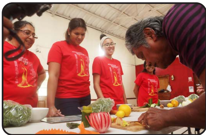
Food Decoration workshop