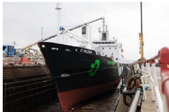
The former RMS in dry dock at the Cammell-Laird shipyard in Birkenhead being transformed to a modern communications centre, racing car paddock and workshop, 64 cabins and science laboratory.

The launch will feature the St. Helena, the floating centre-piece of Extreme E that is tasked with carrying all the championship's cargo, will also be home to a science laboratory to conduct research on the epic voyage. A dedicated filmmaker will be embedded on-board to bring the scientific and environmental stories between races to life. The Dear Old Lady was celebrated far and wide as the RMS St Helena, the last of the ocean-going Royal Mail Ships and one of a dying breed of mixed passenger and cargo vessels. It seems certain our old and trusted friend will continue to be celebrated and respected in her new role.