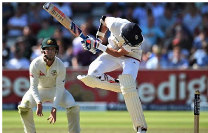
Batsman bowled a beamer

Worse than that, this committee has been held up to be a defender of customers' interests. Apart from probably never having been in existence, it could never do that job in any shape or form. Throughout the entire life of what is now embarrassingly out-dated legislation there has never been a robust counterpoint to the private telecom monopoly. The electricity and water services have the Utilities Regulatory Authority. One of the URA's responsibilities is to ensure the users of these services are protected from both unreasonable prices and unreasonably low levels of service. An updated Telecom Ordinance which includes establishing the legal framework for a Telecom Regulator has been passed by Legislative Council but has not been enacted. We need an effective Telecom Regulator now.