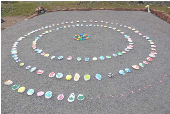
Stones laid by people visiting the burial site during the day