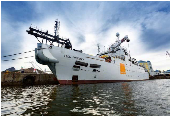
Cable layer Léon Thévenin is moored in Cape Town harbour after a nine-day voyage from Mombasa, Kenya

The Léon Thévenin arrived in Kenya, East Africa, on 6 th August just as an avalanche in the sub-sea Congo Canyon, located north of Luanda, Angola, caused breaks in the West Africa Cable System (Wacs) and South Atlantic 3 (Sat-3) subsea cables. The Equiano cable is also in the area but was not damaged. Some data from the two damaged cables was transferred to the Equiano.