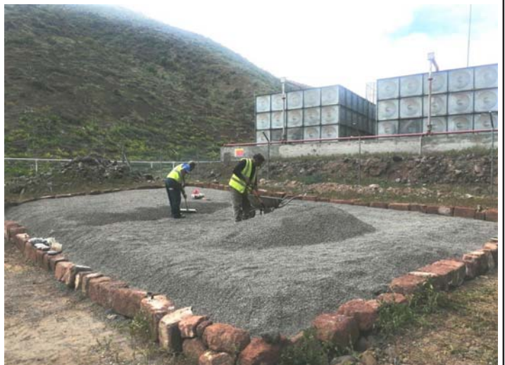
Adrian Duncan's team spreading the gravel over the burial site in preparation for Sundays Commemoration.

People attending the commemoration during the day were invited to lay stones on the burial site as an act of Tribute and Reflection. The stones are laid in concentric circles – the largest circle covering the width of the burial site.