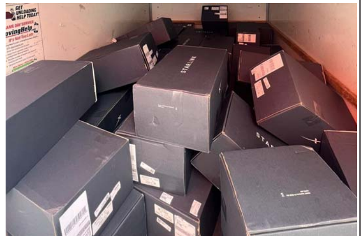
The ISP’s Starlink units in transit. There is a similar photo on some mobile phones showing a large number of Starlink terminals destined for St Helena

The ISP imported Starlink kits on behalf of thousands of its customers for several months. It also manages their accounts with Starlink, but also allows them to take it over and deal with the company directly. It charged R15,000 (£630) for the Starlink kit and R1,799 (£75) per month for the service. Due to enormous demand, it was forced to temporarily pause new orders about two weeks ago.