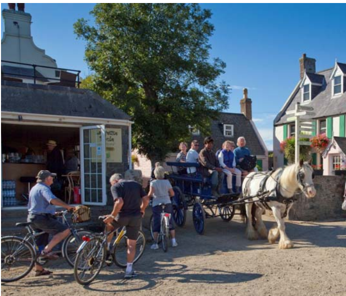
Only bicycles, tractors and the horse & cart are allowed on Sark. Cars are banned.

In October 2019 the unit price of Sark electricity was increased by 29% to 85p per unit. In 2022 the electricity company passed from private to community ownership, with each resident having a vote at the annual general meeting. The new managing director of the Electricity Company praised the new Price Control Commissioner after announcing the most recent price reduction, saying he had “confidence in the new Commissioner’s rigid application of the Law” which “will now open the door to investment that has been on hold for too many years due to painful legal wranglings.”