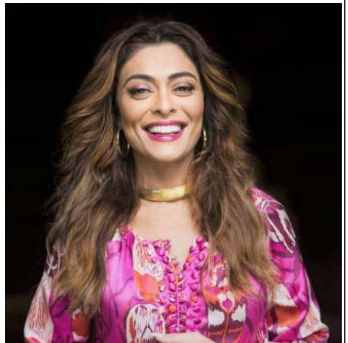
Some readers may prefer this Maria Da Paz – a character in a Brazilian TV soap opera

with containers. Containers could all be returning empty – maybe?