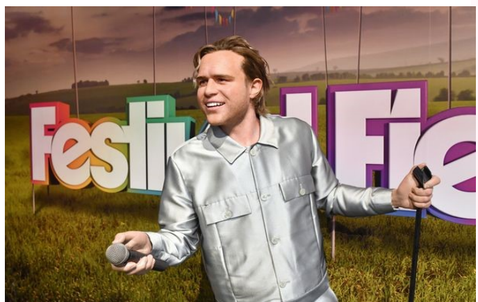
An Olly Murs waxwork at Madame Tussauds in Blackpool

Seeing as it's so small and remote, it comes as no surprise that the population of Saint Helena is just 4,439 according to the 2021 Census and it consists of a tight-knit low-crime community. The whole island is just 45 square miles and is a third of the size of the Isle of Wight - the same size as Disney World in Orlando.