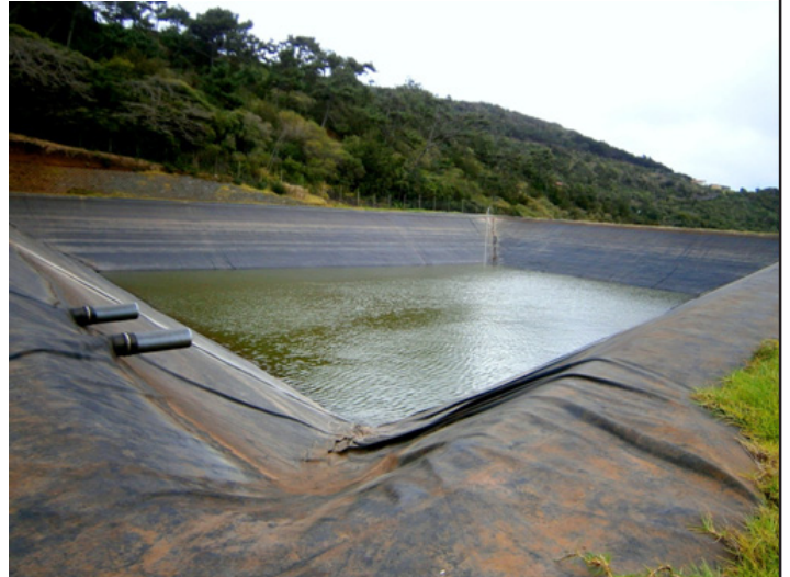
Harpers No 3 reservoir – stored water level has increased but no water flowing through the supply pipes when this photo was taken.

The second main message is there has been a noticeable reduction in water usage. Last Tuesday the average daily consumption was 1,100 cubic metres per day. Since then the average has fallen to 927 cubic metres per day. The rainfall together with the reduced water usage has meant the in the last few days of June the amount of water in the reservoirs has not reduced further and in some cases the reservoir level has increased. Overall, the amount of water stored in reservoirs has increased by just 2%. The average daily reduction in stored water for the whole of June (water flowing out being more than water flowing in) was 190 cubic metres per day. Without the recent rain the figure would have been higher.