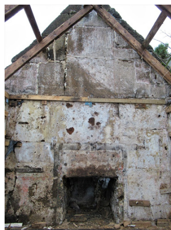
Original gable end of the old house with remnants of the clay white wash and the imprint of the fire surround.

A glimmer into our past is always a truly wonderful site to see.