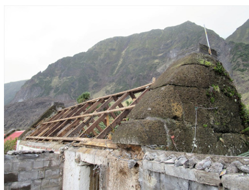
Roof of the old property showing the puzzle like soft stone gable ends.