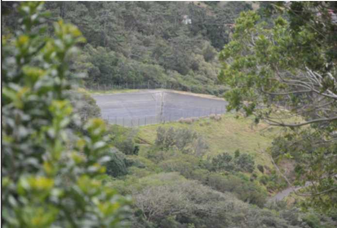
Harpers No 3 two weeks ago. It was reported there was 20 metres of water left in the reservoir

The biggest increase in water supply has been from the bore holes. The Harpers reservoirs rely on surface run-off so they will not fill to capacity until the ground is saturated. At present the rain is being absorbed into dry ground several metres deep with the surface remaining mainly dry.