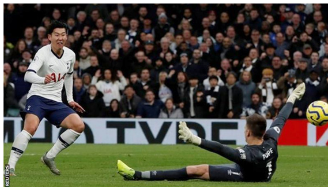
Son Heung Min 3 goals and 5 assists in his last 6 Premier League matches

Ferguson was put in temporary charge after Marco Silva was sacked following Everton's defeat in the Merseyside derby.