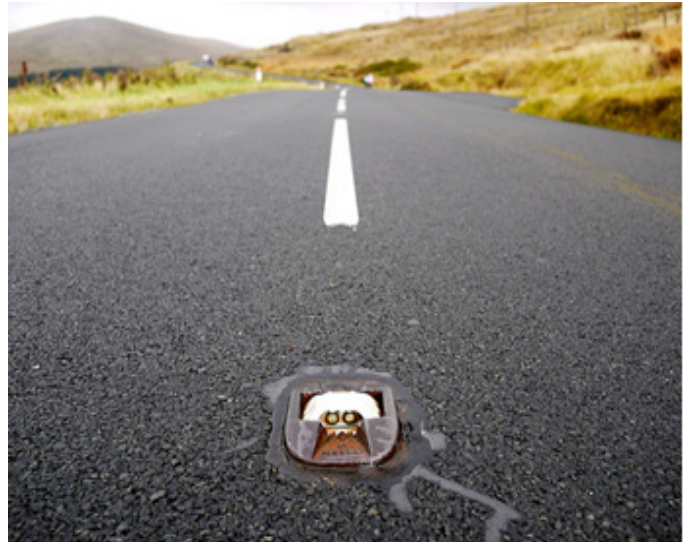
Cats eyes can illuminate either the centre line of a road or road limits on either side of the road

9. The Planning Design statement should say that all exterior lighting is 'dark sky compliant' as well as low energy. This is a very valid point and we will take it on board. Precinct lighting ( in and around the housing development ) has not yet been handled. However, it would be our intention to use solar operated cat's eyes on the internal paths, which project very limited amounts of light. We can certainly take steps to make sure the whole project is dark sky compliant.