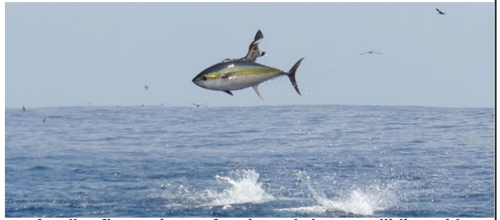
A yellowfin coming up for air- and almost colliding with a bird

Warmer water, the IUCN study concludes, holds less oxygen.