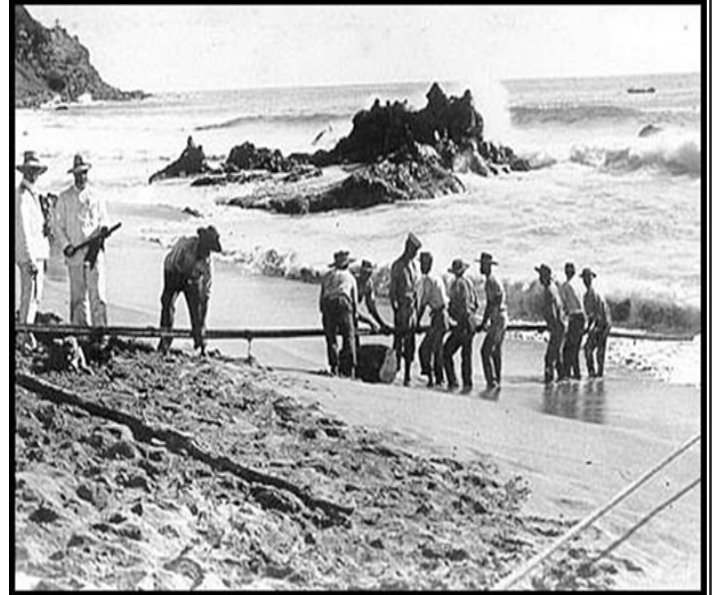
Bringing the cable ashore at Norfolk Island in 1902

sation dates back to 1901 with the creation of the Pacific Cable Board; linking Canada to Australia and New Zealand via Fanning Island, Fiji and Norfolk Island by submarine cable. The present organisation was formed from it in 1967. OCT has well over 100 members and can claim to be the largest as well as the oldest organisation of its kind in the world.