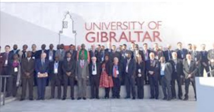
All the delegates at the 2018 CTO Forum in Gibraltar can't squeeze into the photo

Several events are organised every year by the CTO with six already lined up for 2020-21. Apart from Forums there are Round Tables and Council Meetings. London is a regular venue for meetings but Samoa, Vanuatu, Jamaica, Botswana and Bangladesh are among other countries also hosting meetings. Next year Gibraltar is hosting a CTO Council Meeting. The CTO Forum in March will be St Helena's 3 rd international meeting after the two SAERI sponsored environmental conferences in 2018 and 2019. If the CTO Forum next year goes as well as the 2018 and 2019 conferences there may be a welcome opportunity for further CTO events in St Helena in the future.