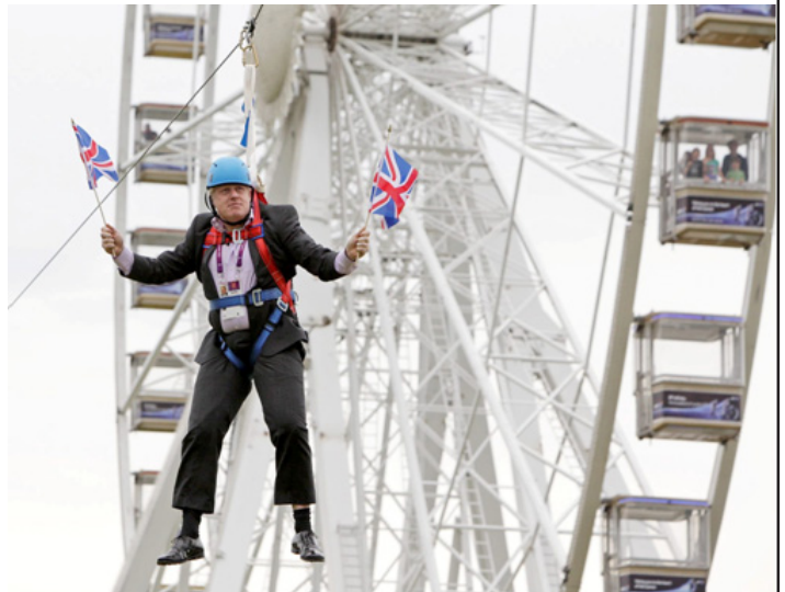
The British Prime Minister in an un-Statesman-like pose

Before the last pages of the Independent go to print we should have a better idea how the UK general election will turn out but, as it stands, the Conservative leader, Boris Johnson, is favourite for a return to 10 Downing Street. Johnson used to be the Foreign Secretary and while in that job he argued for DFID and its big pot of £13.4 billion foreign aid money to be combined (or swallowed up) by the Foreign and Commonwealth Office. Recent reports suggest he has not forgotten about this.