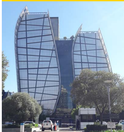
ABSA Building in Sandton, Johannesburg Britcham Office