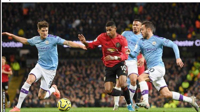
Marcus Rashford man of the match in the Manchester derby

Manchester City is now 11 points behind league leaders Liverpool.