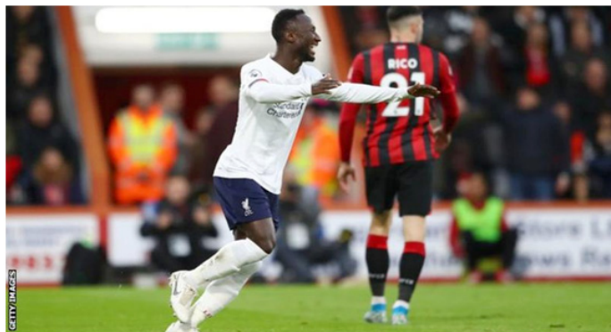
Keita became the 16 th player to score for Liverpool in the Premier league this season

Even at this early stage Liverpool are odds one favourite to pick up the League title this season.