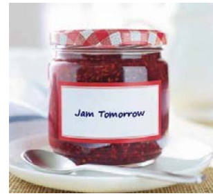
Another 'Buy Local' campaign?