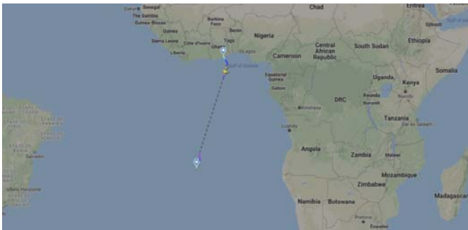
Following a brief fuel stop, it continued on its journey, landing safely at Saint Helena just in time for lunch.