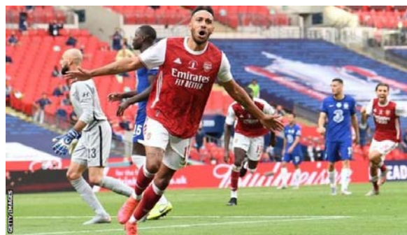
Arsenal striker and Captain Pierre-Emerick Aubameyang sign a new 3 year deal with Arsenal said to be worth £55m.

In other matches Everton put in an impressive performance against Spurs as they defeated them 1-0 with a goal from Calwen-Lewin. Everton three signings James Rodriguez, Brazil's Allan and Watford's Abdoulaye Doucoure were brilliant in their debut for the 'Toffees'. Everton could be the dark horses who could challenge for European places this season.