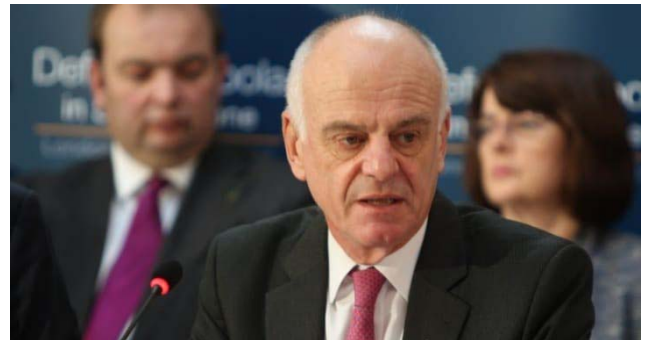
WHO representative Dr David Nabarro giving a global view of the coronavirus pandemic to the UK Foreign Affairs Committee

To emphasise his message further, Dr Nabarro told the Foreign Affairs Committee, "We're beginning to see what damage it's going to cause to the world, and it's getting nastier. ... It's a terrible situation," and, "A health issue has got so out of control it's [causing] ... huge economic contractions which will probably double the number of poor people, double the number of malnourished, lead to hundreds of small businesses going bankrupt, and generally wreck the destination for a lot of young people who are not going to get education or opportunity," he said.