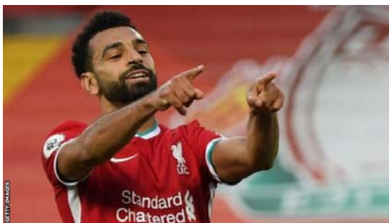
Mo Salah in form from day one with a hat trick

Three times Liverpool took the lead and three times Leeds showed great character to equalise; it took Liverpool's Egyptian King Mo Salah to complete his hat trick from the penalty spot to give the champions a perfect start in the defence of their title.