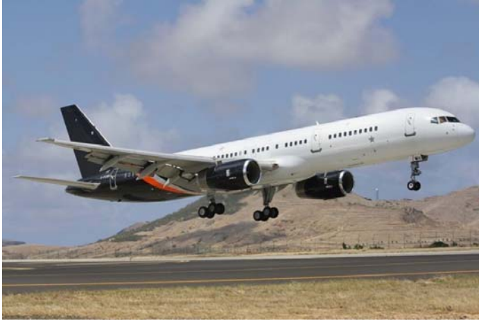
Titan's 757 touched down in Saint Helena around lunchtime Wednesday.

Saint Helena has welcomed its latest arrival. On Wednesday, a Titan Airways Boeing 757 touched down at the airport as the first direct flight from London. To mark the occasion, we thought we would take a look at which aircraft are actually capable of landing at this beautiful location.