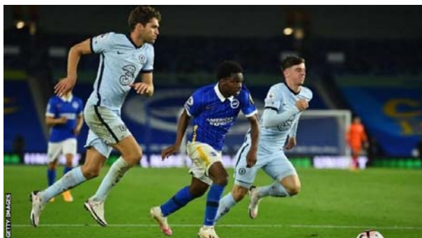
Chelsea new boys Timo Werner and Kai Havertz was out performed by former Chelsea youngster Tariq Lamprey who put in a man of the match performance for Brighton and created a number of chances for the South Coast team.

The other team that loss an impress me was Brighton as their attacking play against Chelsea was great to watch. Individual errors at the back for two of the goals cost them the game and handed Chelsea all 3 points. The second goal that Chelsea scored was a brilliant thunder bolt from their Full Back Reece James.