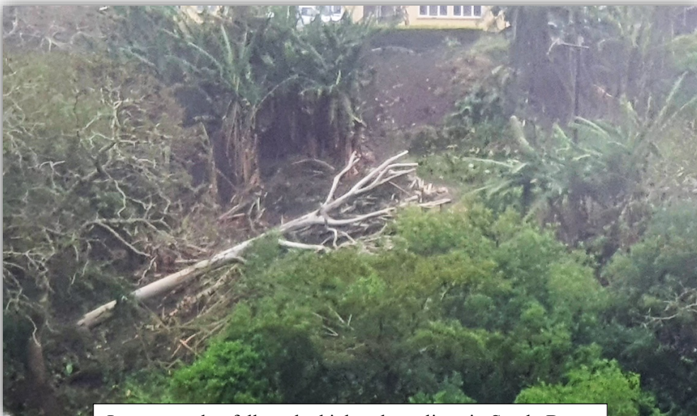
Large tree that fell on the high voltage lines in Sandy Bay

These unplanned power outages occurred as a result of the recent heavy rains and wind. Branches were blown onto the high voltage lines in Sandy Bay and Sunberry, causing the power to go off. On one occasion in September, a tall tree fell onto the high voltage lines causing the lines to come away from the pole and the power to go out. Because this incident happened at night and due to lack of visibility, it was not safe to attempt repairs until morning.