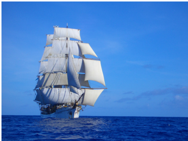
The Picton Castle in full sail

Picton Castle, the three masted barque anchored in James Bay this week started its current voyage from New Orleans in April last year. Sailing west through the Panama Canal the ship with its twelve crew and up to forty sail trainees has crossed the Pacific Ocean, passed Australia to the Indian Ocean and is now heading homeward through the Caribbean and finally to drop anchor for the last time in Nova Scotia, Canada where the ship is based.