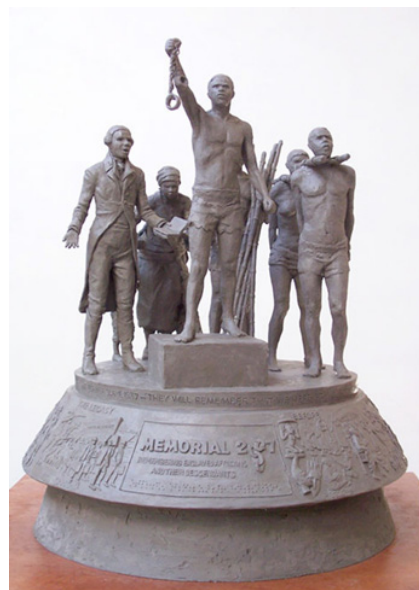
A model of the slave memorial supporters would like to see in Hyde Park

And finally, there is a report this week about the unsuccessful attempt to bid for funds to make the Liberated African Burial Grounds in Rupert's a place where their memory can be respected. At the same time there is a petition being organised in the UK for a national memorial to remember the victims of the slave trade. It can be found at https://www.change.org/p/uk-government-build-memorial-to-remember-the-victims-of-the-slave-trade .