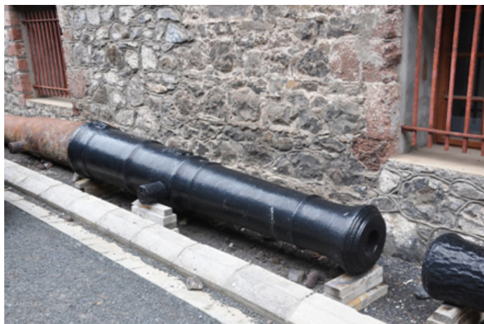
Walker Cannon number seven – ready to grace a St Helenian historic location

In addition to the four at what is historically called the East Bastion, near the entrance to the controlled port area at the wharf, there are two at the main passenger entrance to the airport and a seventh lies at the back of the Museum of St Helena awaiting a new purpose in life.