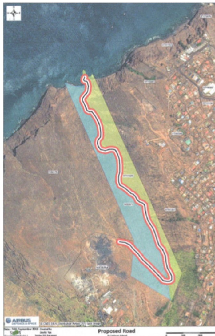
The route of the proposed track from Donkey Plain to the Breakneck Valley shoreline

cerns raised by the Authority and then take the application forward without any reference back. It will be interesting to see how Exco members approach this development application.