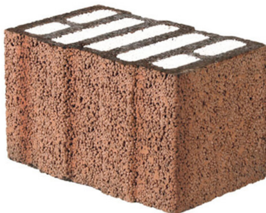
A Liaplan ultra-block made from expanded clay and filled with hardened foam

The storage shelter will be constructed with steel framework and, like the eco-lodges, have a north facing mono-pitch roof with photovoltaic panels to generate renewable power. Within