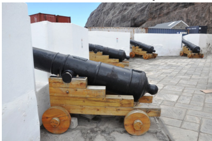
Four preserved Walker cannon displayed outside the customs building. Rotherham, the home of the Walker Cannon, has two and now wants another