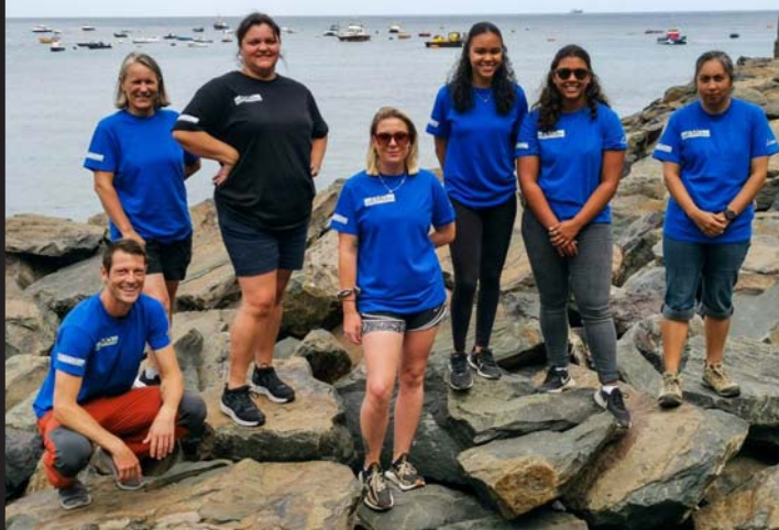
RRS Discovery St Helena Scientific Expedition Begins

VOLUME XVIII ISSUE 1, 2 nd DECEMBER 2022, PRICE £1