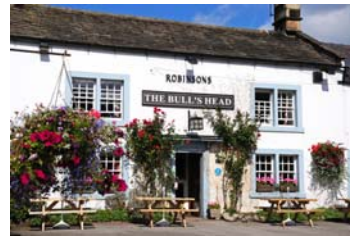
Disappearing English Country Pubs