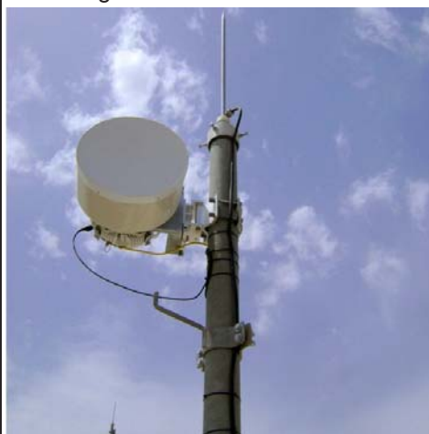
Microwave transmitters come in different shapes and sizes – this is one of them

The proposal is that Maestro will build an island-wide telecom network which is a fibre connection from the cable landing station in Rupert's Bay right to each home or business for about 80% of all properties. The exact figure will be confirmed when Maestro submit their detailed design for the new Island-wide high speed network in a week or two. The remaining 20% will be to the outlying areas where the final link in the new digital (non-copper wire) network will be a connection using microwave transmitters located on high points and serving specific areas. Every property within range of a microwave transmitter will have a small receiver to make the final connection to the home or business and to the digital equipment used within each property from phones and televisions to all the digital services available using computers, from web browsing, messaging and e-mail to streaming online video.