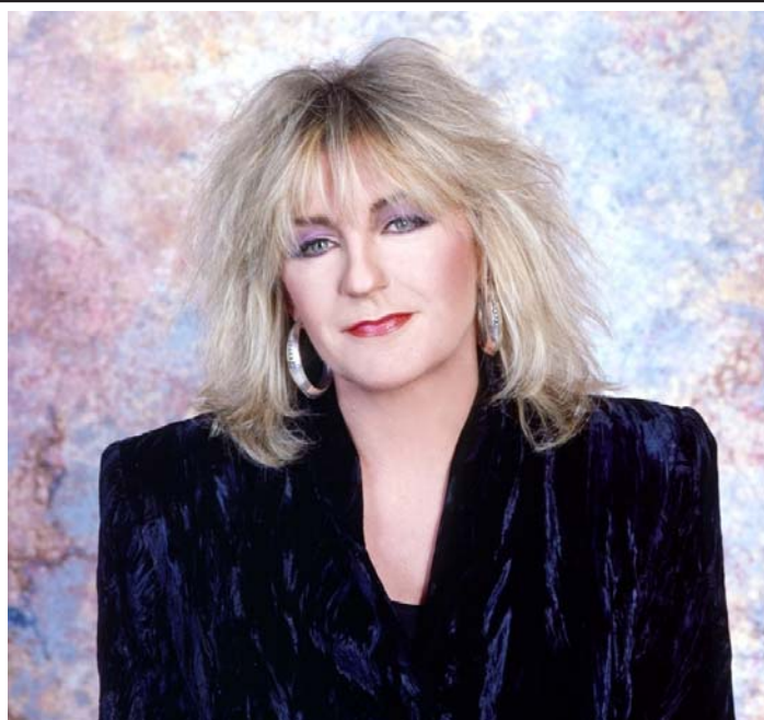
Christine McVie RIP

But she rediscovered her love of performing at a one-off appearance with the band at London's O2 in 2013 and returned to them a year later.