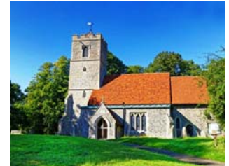
Disappearing English Parish Churches