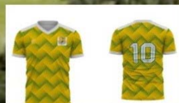
5 th Prize: St Helena Football Kit