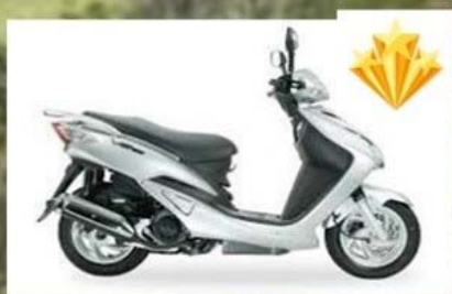
Star Prize: 125cc Sym Scooter