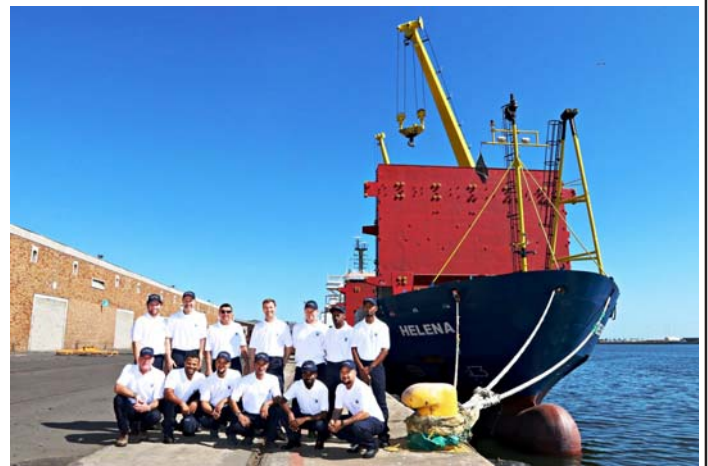
The crew on the first call of the MV Helena

However the fact remains we are in severe danger of not having any cargo delivered in February. It is certain no UK cargo can be received in February as the delivery deadline has now passed. Cargo originating from South Africa can be sent by ship for February but there may be no ship to bring this cargo. It will also be an enormous cost for sending just a few containers? The loss in revenue will hit the SHG shipping budget even harder than all the other MV Helena voyages which have carried fewer containers than there used to be.