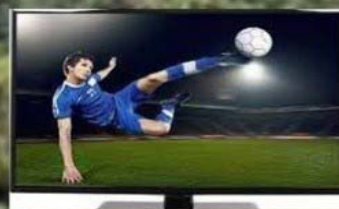
2 nd Prize: Flat Screen TV