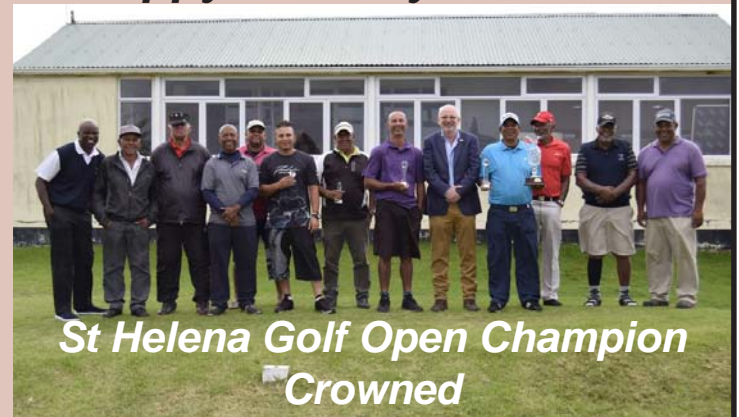
St Helena Golf Open Champion Crowned

CHRISTMAS GREETINGS FROM THE ROYAL ST HELENA POLICE SERVICE!!!!