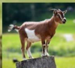
4 th Prize: A Goat