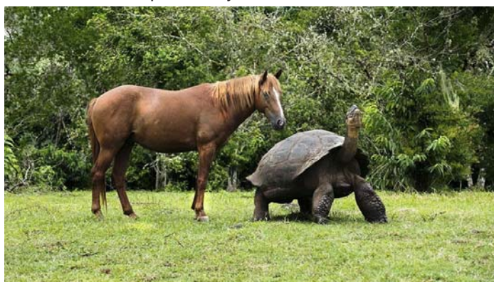
A Galapagos Giant Turtle and a horse enjoying the security provided by the Galapagos Conservation Trust

The work that many scientists have done has brought into focus the outsize role that islands play as repositories for huge numbers of plants, animals and other life forms, especially rare species. As the study's authors point out, islands hold around 40% of all threatened vertebrates on just 5% of the world's land area. Many island species are found nowhere else — part of the reason that more than 60% of the world's extinctions in the past 500 years have occurred on islands.