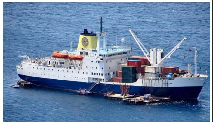
It all seemed to work a lot better before the ‘improvements’