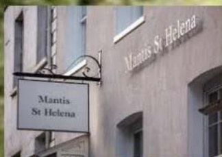
3 rd Prize: Staycation at Mantis