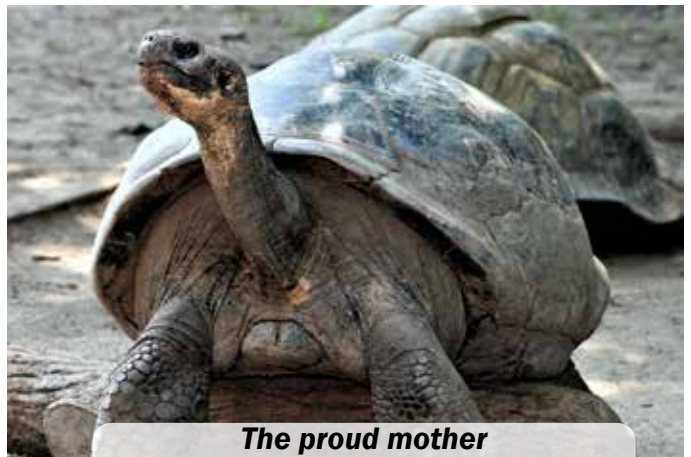
The proud mother

The hatchlings weigh between 70 and 80 grams and being given constant care behind the scenes at Pennsylvania Zoo. On 23rd April the new arrivals, the first in the 150-year existence of the zoo, will make their public debut to