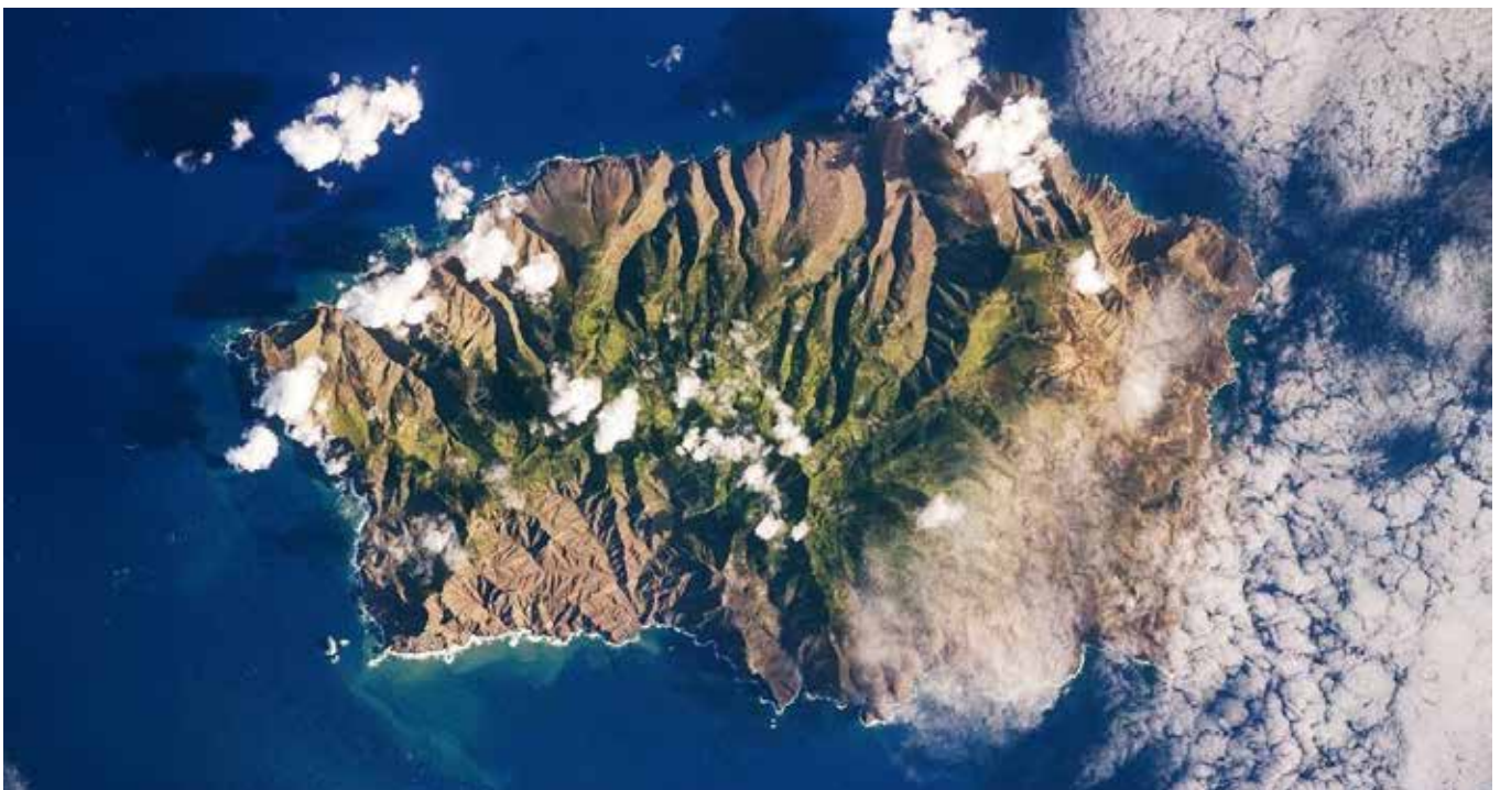
Saint Helena, as viewed by astronauts

The opportunity notice provides an overview of the responsibilities of the government, and reinforces the remoteness of the place it represents.