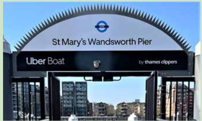
After. . .