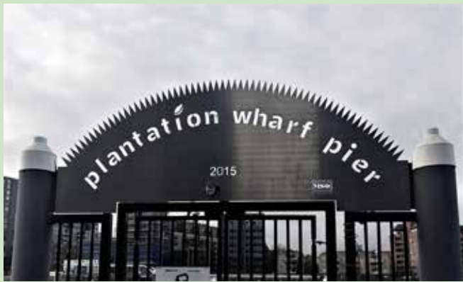
Before. . .