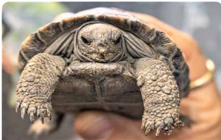
One of the four hatchlings at Philadelphia Zoo

coincide with the 93rd anniversary of their mother's arrival at the zoo.