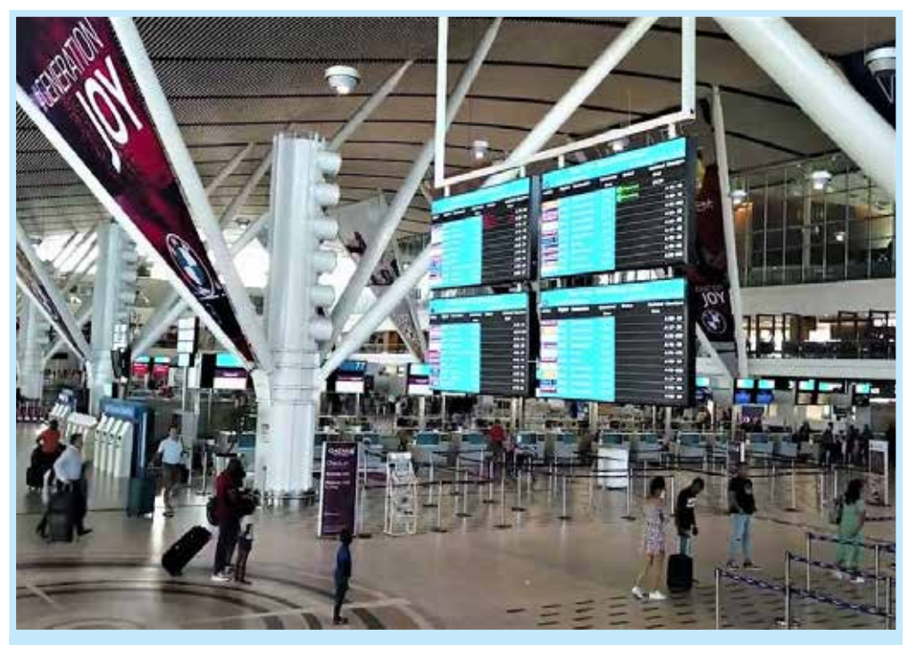
Cape Town International check-in hall

Jo' burg's OR Tambo Airport did not receive any awards.