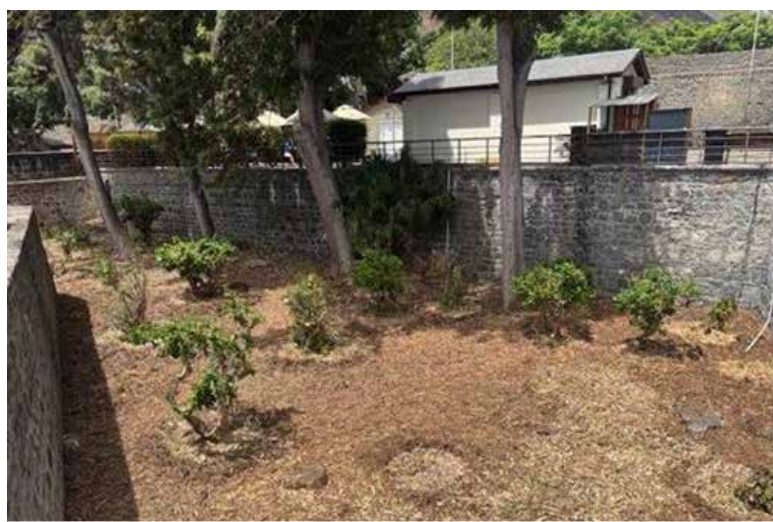
The section of the moat at The Coffee Shop after the clearance operation

The moat before the clearance work started