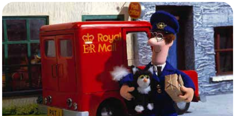
Pat can get the job done...