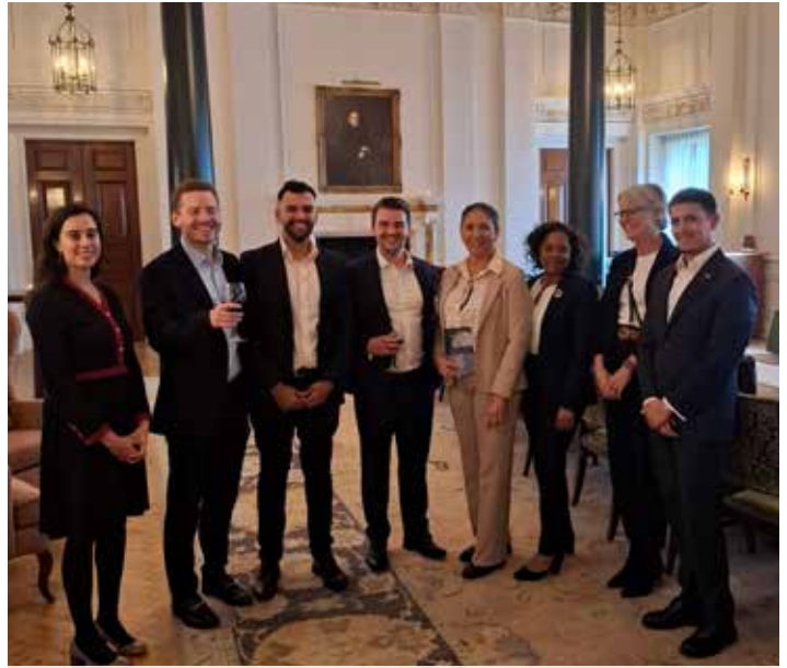
Members of the Lloyds Bank Team with guests.

It is to be hoped that one or more of the Lloyds Bank Team will visit Saint Helena in the not-too-distant future.