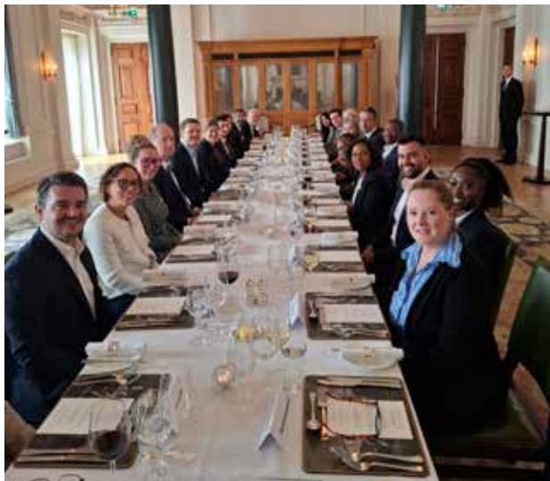
Guests seated before the meal.