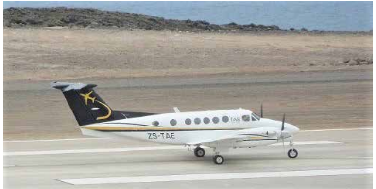
Beechcraft Super King Air 200, ZS-TAE, touches down

The skies were rather grey and not unusually for September, it was somewhat breezy, but nevertheless, these eager and excited individuals (which included me), watched and waited for the first aircraft from another country to arrive.