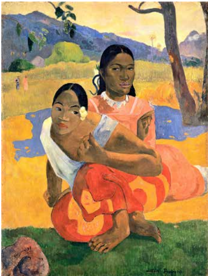
When Will You Marry? 1892

The island of Tahiti, French Polynesia in the Pacific Ocean is known for many things. Notably, it is where Paul Gauguin produced many paintings in his own inimitable style. Many of his paintings were of Tahitians and most of those were girls.