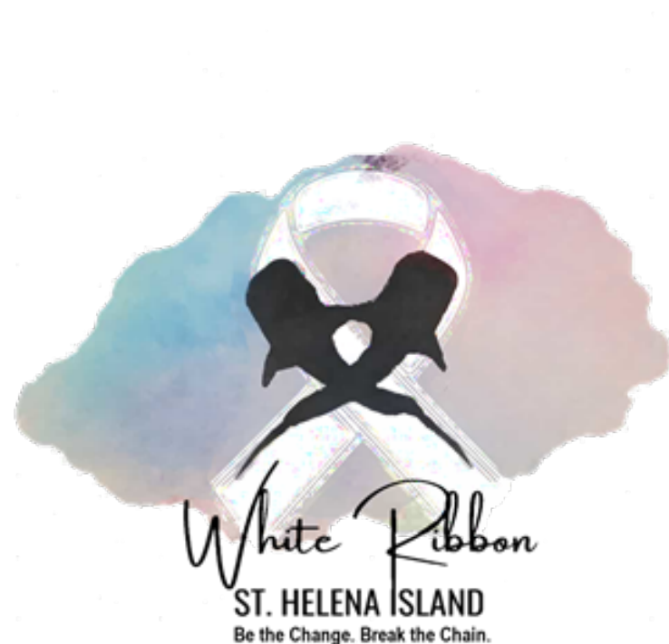
Locally designed White Ribbon Logo

The 16 Days of Activism Against Gender-Based Violence is an international campaign that runs from 25 November (White Ribbon Day) to 10 December (Human Rights Day). On St Helena, we extend this to 13 December, concluding at the Football Presentation event with a moment of silence and closing reflections, a powerful way to unite sport and community in the fight against violence and discrimination.