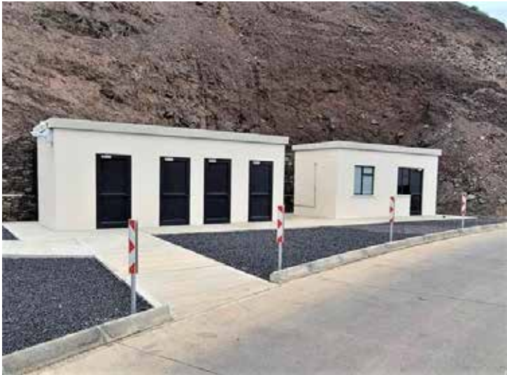
The new toilets

Opening today are new, modern public toilet and shower facilities located in Rupert's, adjacent to the Saints Tuna Corporation building.