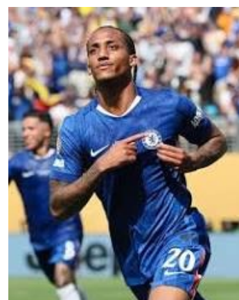
Man of the Match

United's second win in as many games under Michael Carrick moves them above Chelsea and Liverpool into fourth, with Arsenal's lead at the top now only four points.