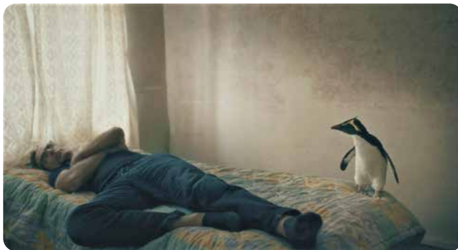
Main publicity image for Tristan Forever