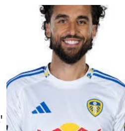
Man of the Match

Mathys Tel went from hero to zero for Spurs, opening the scoring with a curling effort in the 50th minute to put Roberto De Zerbi's inside in front, but then being involved in conceding Leeds' equaliser at the other end soon after.