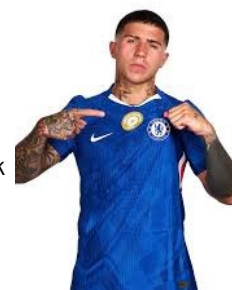
Man of the Match

Arne Slot's team, who would have all but secured UEFA Champions League football with a win, were without Mohamed Salah, Florian Wirtz and Hugo Ekitike but still took the lead through Ryan Gravenberch's sixth-minute stunner.