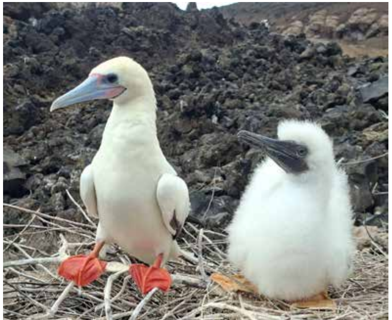
A mature red-footed booby and chick

It has been an incredible year for these seabirds!