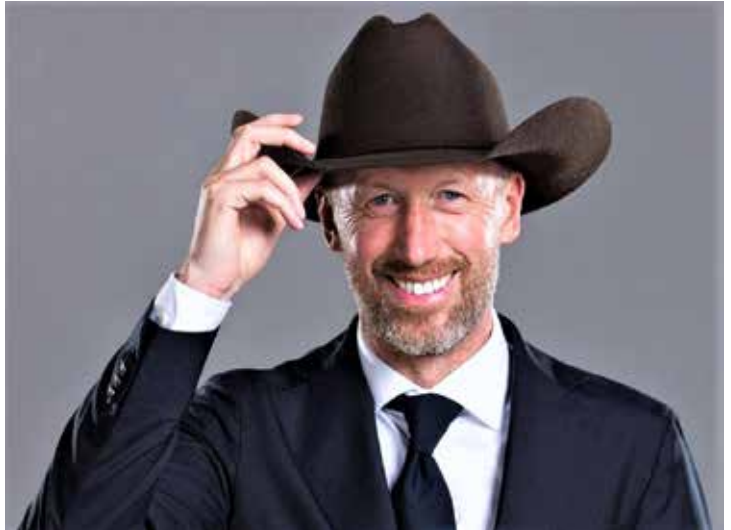
Graham Potter – enjoying life in Texas this week

Graham Potter was appointed head coach of the Swedish national team in October last year. In the world cup qualifiers, Sweden had drawn two and lost four but somehow they were in the play-offs. Under Graham Potter they beat Ukraine in the semi-final, then Poland in the play-off final. This week, Sweden, ranked 35th in the FIFA rankings ran out 5-1 winners against Tunisia, ranked 56.